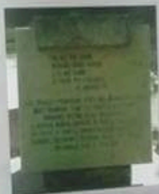
Parco Montano, Picinisco, Italy (1998)

Designed by Stephen Church and Alan Day Commissioned & installed by the UK Air Force, Cardiff and Cardiff City Council Commissioned by the British Red Cross Society