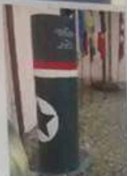
Museo Paolo Cresci, Lucca, Italy (2004)