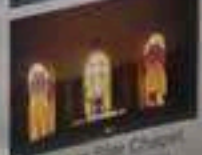
Arandora Star Chapel, Bardonia, Italy (1989)