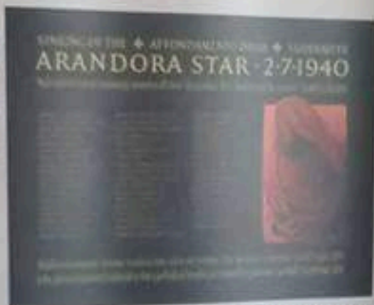
Metropolitan Cathedral of St David, Cardiff, UK (2010)

Many regions across Italy and the UK have since created memorials to recognise their losses who died in the tragedy.