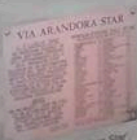
Via Vittime 'Arandora Star', Bardonia, Italy (2004)