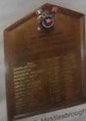
Town Hall, Middlesbrough, UK (2009)