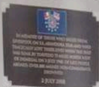
Pier Head, Liverpool, UK (2008)

Great War Memorial 1 with which the Arandora Star Memorial is linked