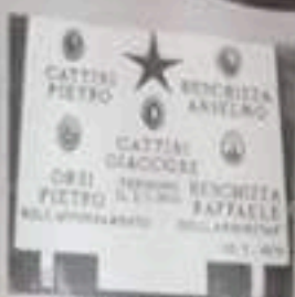
Bratto, Italy (1975)

Great War Memorial 1 with which the Arandora Star Memorial is linked