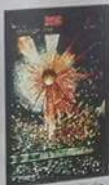
Formerly Casa d'Italia, Glasgow, UK (1975)