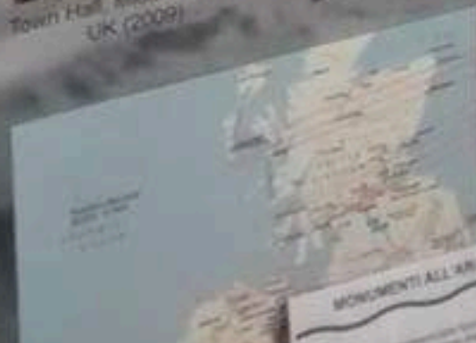
MONUMENTI ALL'ARANDORA STAR